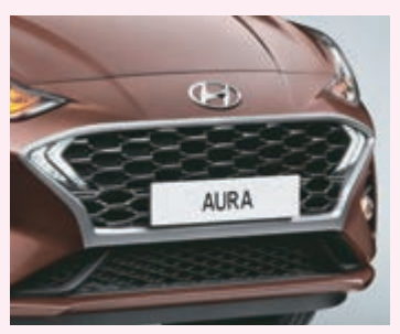
Satin Silver Front Grille Design

Observe its coupe-like side profile with a sporty stance. It's hard to look away from The All New AURA. It is meticulously crafted to infuse freshness with design and set a new trend among modern and stylish people.