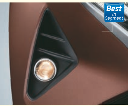
Projector Fog Lamps with Chrome Surround