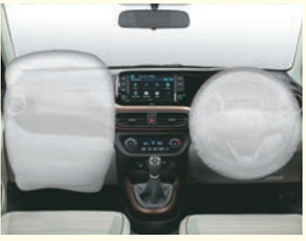
Driver and Passenger Airbags