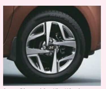
Sporty Diamond Cut Alloy Wheels