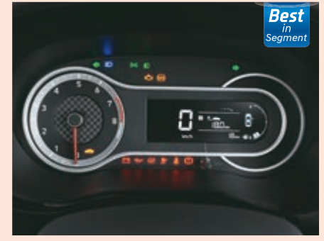
13.46 cm Digital Speedometer with Multi Information Display