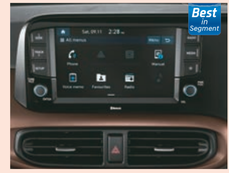
20.25 cm Touchscreen Infotainment System with Smartphone Connectivity