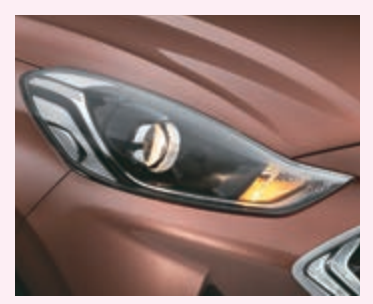
Swept Back Projector Headlamps