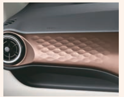
Satin Bronze Crash Pad for Premium Appeal