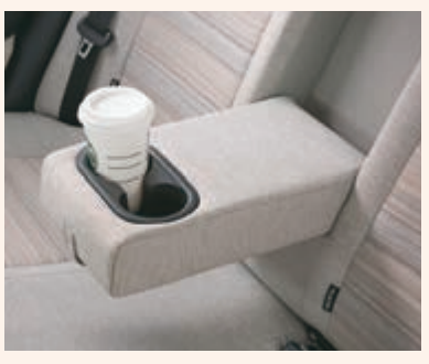
Rear Center Armrest with Cup Holder