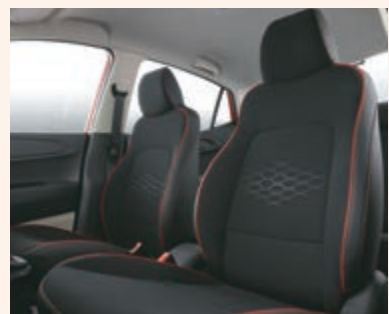
Sporty Black Interiors with Red Inserts in Turbo Variant