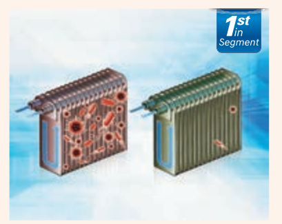
Eco Coating Technology