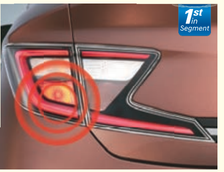
Emergency Stop Signal