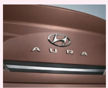
Rear Chrome Garnish with Unique Center Stylish Z Shaped LED Tail Lamps Spread Branding