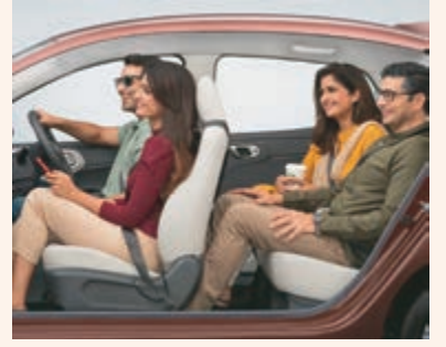
Superior Cabin Space with Ample Legroom Dual Tone Grey Interiors & Thigh Support