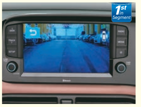
Driver Rear View Monitor (DRVM)