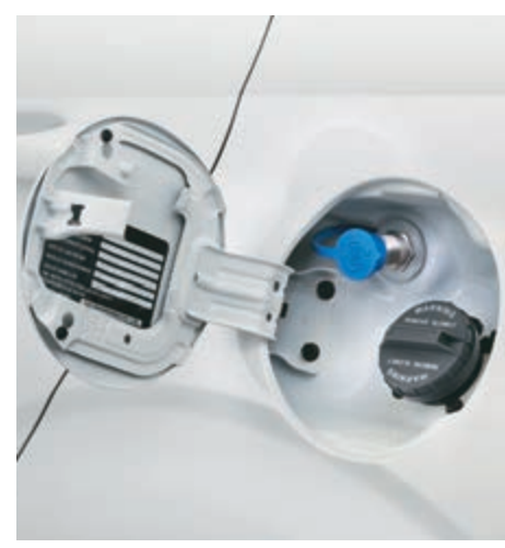
AMT in Petrol & Diesel